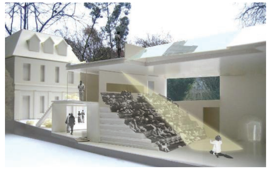
MBI Al Jaber Building in Oxford

It is my pleasure to introduce the latest newsletter from the MBI Al Jaber Foundation. Spring is always a busy time for the Foundation, as we process the applications for our scholarship schemes.